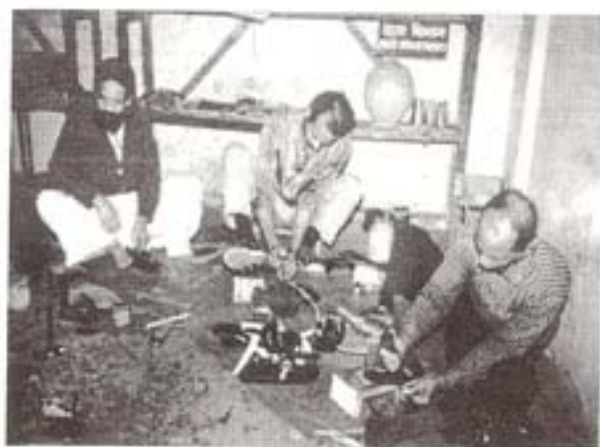
Patients are provided with protective footwear, to prevent ulcers.