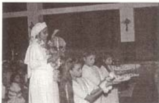
The day begins with prayer, at Nirmala.