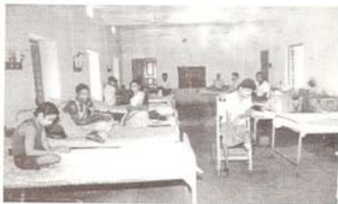
Life in the Ward.