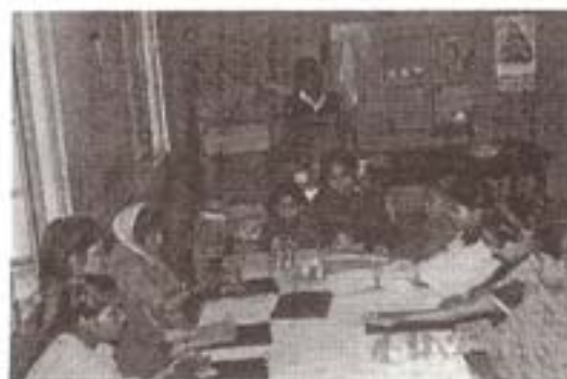
Physiotherapy Therapeutic Exercises being given to the patients.