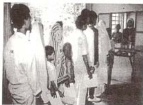
Multi-drugs being distributed, free of cost, to the patients.