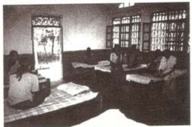
People carrying a double burden : Leprosy and Tuberculosis.