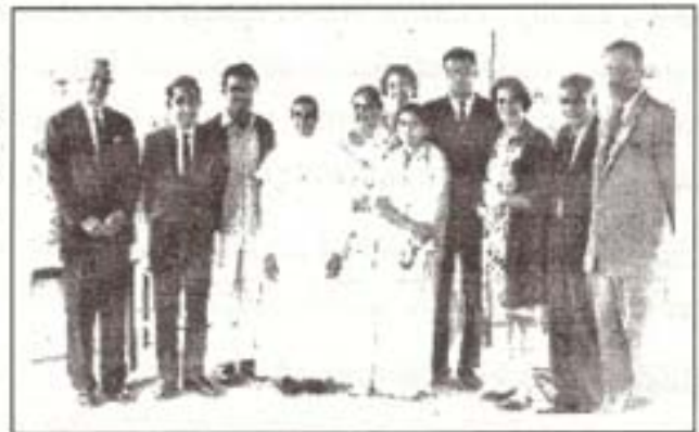
Friends & Well Wishers at the start of the hospital

Leprosy patients of Dhanbad district, shunned by their family, driven away from markets and wells, were seen cowering under the cool of the trees outside the towns and villages, beyond human habitation.