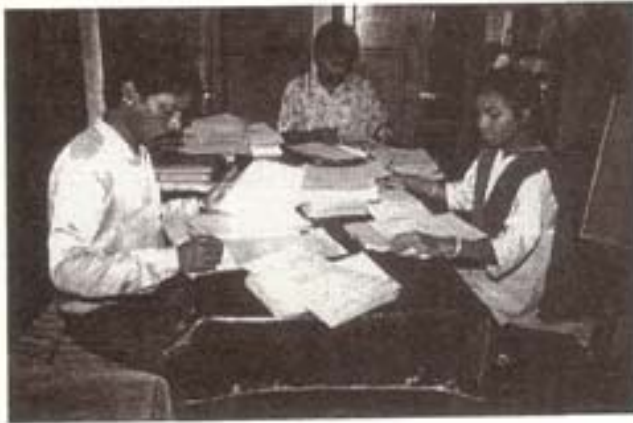
The Staff seeing to the medical records.